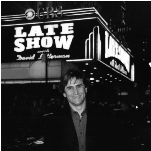
Alex Zanardi at the CBS studio in New York.